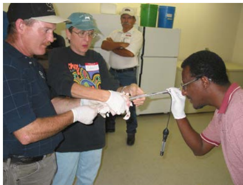
What is this person looking at? Attend our artificial insemination workshop and find out.

The Goat Extension Program will be conducting two artificial insemination workshops this fall. The first will be at Langston University on Saturday, September 6, 2003 and the second will be at the Cherokee County Fairgrounds in Tahlequah, OK on Saturday, October 11, 2003. Both workshops will present basic