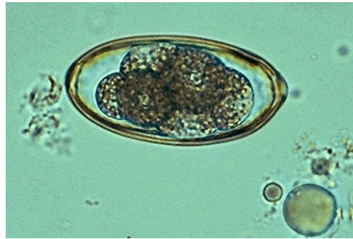
What egg is this? Attend the controlling internal parasite workshops and find out.

parasite life cycles, dewormers, alternative treatments and will experience a hands-on training session on how to conduct fecal egg counts.