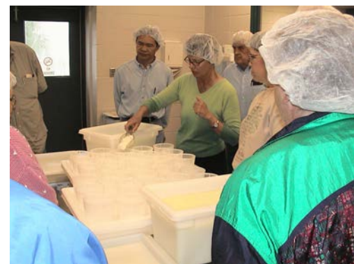
What is this person doing? Find out at the cheesemaking workshop.